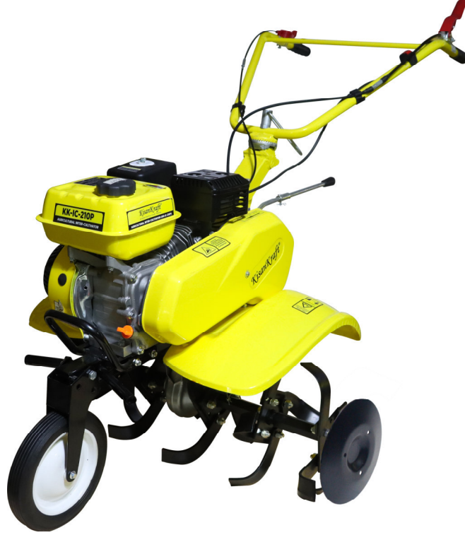
KISANKRAFT, KK-IC-210P POWER WEEDER

THIS TEST REPORT VALID UP TO : 30 th September, 2027